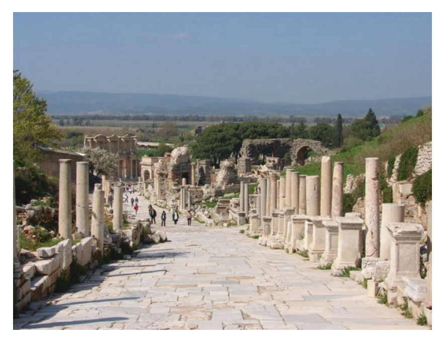
Fig. 3.4 Ephesos (View of the harbour from the so-called Curetes Street)

ancient city. According to Foss (1979), the building of the fortifications on the hill of Ayasoluk, during the seventh- and eighth-century Arab raids (on land and sea), together with the silting up of the harbor and the abandonment of the Episcopal complex of St. Mary, brought about the slow demographic and economic decline of the ancient lower city; meanwhile, in the late seventh century Ephesos was endowed with a new walled enceinte which, apparently in a careless way, set aside the two/third of the old urban landscape, incorporating buildings like the theatre and the stadium. Two different urban-like foci came to the fore: the old city landscape, which lay in ruins, and the hill of Ayasoluk where the Justinian's great basilica built over the burial of Saint John and a later fortification, enhanced its role as successor of the Classic Ephesos.